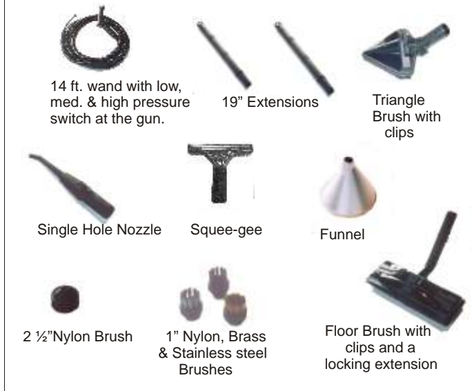
14 ft. wand with low, med. & high pressure switch at the gun.