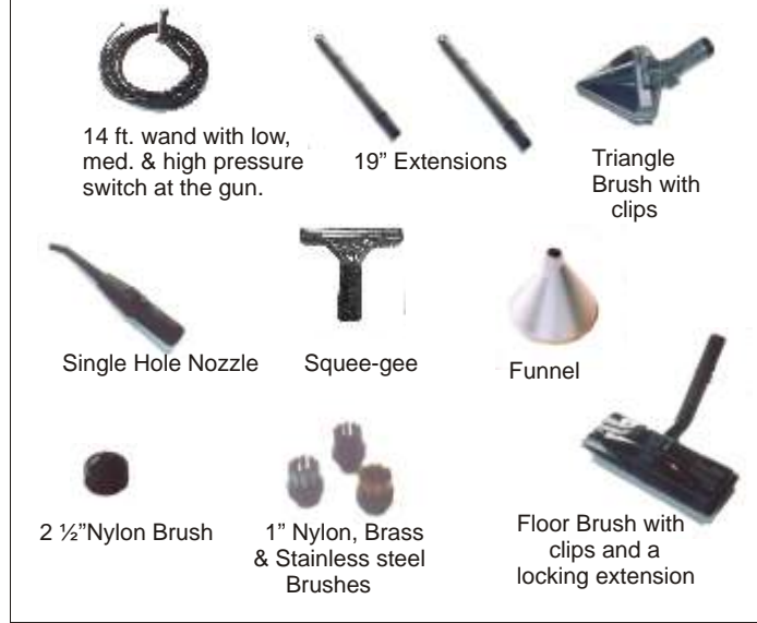
14 ft. wand with low, med. & high pressure switch at the gun.