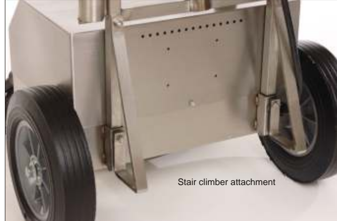
Stair climber attachment